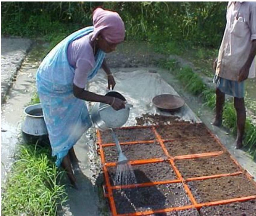
Spraying fertilizer solution (Sprinkle 0.5% urea + 0.5% zinc sulphate solution at 8-10 DAS)

Spraying fertilizer solution (optional): If seedling growth is slow, sprinkle 0.5% urea + 0.5% zinc sulphate solution at 8-10 DAS.