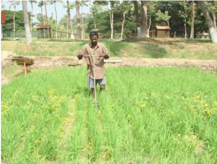
Incorporation of green manure