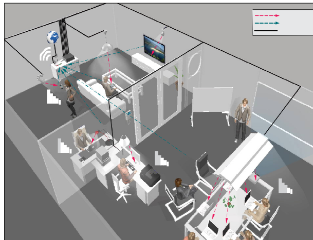
Figure 1 : VLC downlink, Wi-Fi uplink

Given the aforementioned challenges, we add an additional tier in wireless HetNets comprised of indoor gigabit SCs to offer additional wireless capacity where it is needed the most.