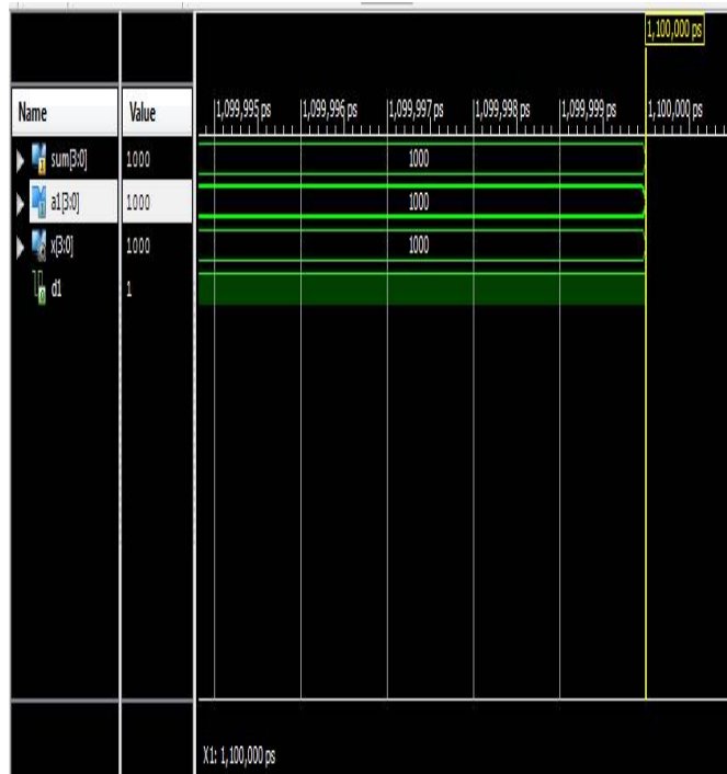
Fig.4. Standard basis CDMA decoder