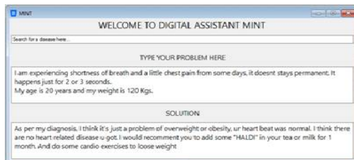
(MINT IN ACTION)