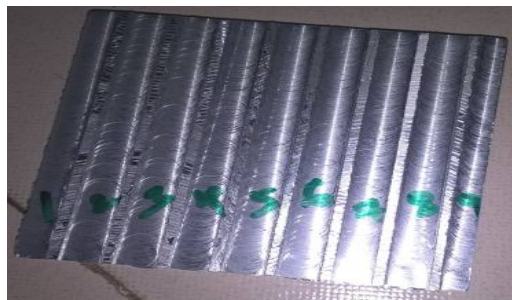
Figure 1 Work piece 6463 Aluminium Alloy

Work piece material: The experiment is carried out on 6463aluminum alloy and brass materials (100 x 95 x 10 mm) and (160×75×10mm) 9 blocks.