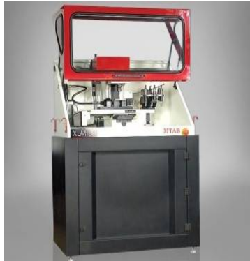
Figure 1: Working Machine XL Mill

Working Machine: For the experiments XL CNC Machine is used