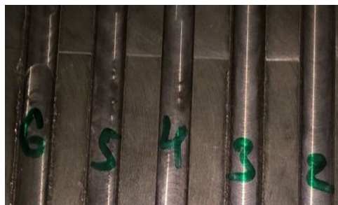
Figure 3 Work piece Brass

Surface Roughness Tester: Taylor Hobson Surface tester is used for taking Ra values. It contains a probe which is movable. By some force this probe is moved on surface of work piece.