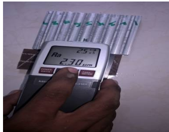
Figure 4: Surface roughness tester (Talysurf)

Experimental Conditions The following experimental data is obtained by conducting milling operation on 6463 aluminium alloy and brass materials using CNC end milling.