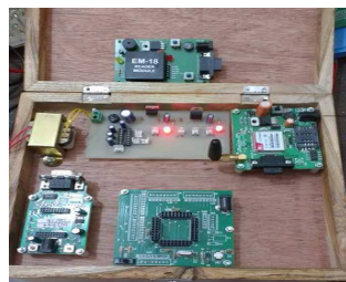
Fig 2:- Hardware of proposed Model