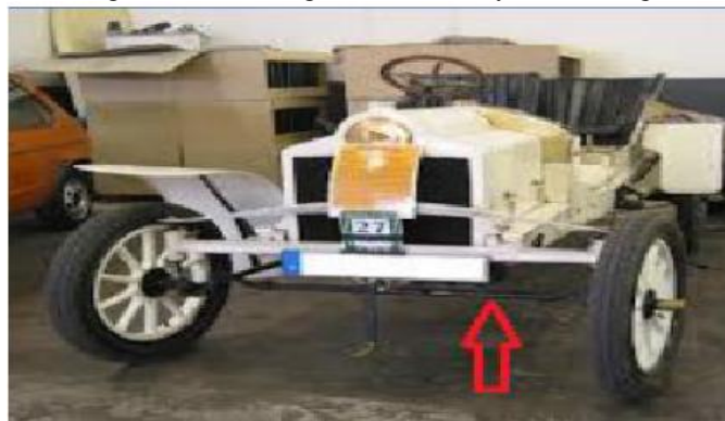
Fig 1.3: Old Vehicle Dependent System

Dependent suspension system is the system in which two wheels (front or rear) are connected to each other by one continues rod called as trailing rod. In this system if any bump or potholes disturb to one wheel automatically pair wheel also affected because of trailing rod. The trailing rod is shown by arrow in figure 1.3.