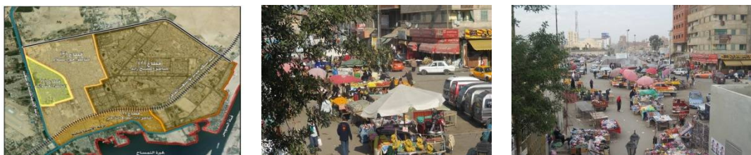
Fig.2. Sample of students' final project in Urban Studies & Humanities

The course aims to study the effect of the human behavior of the society on the architecture and urban production. As well as the course includes a study of the correlation between architectural design and human behavioral and psychological dimensions of society and the effect of socio- cultural, economic and humanitarian considerations, which in turn reflected on the design process. The course discusses the climate change and sustainable policy in the field of urban design and its impact on the urban communities and how to apply the sustainable policy. Fig.2. Shows sample of students' final project "Studying the human activities in an urban space in Ismailia City" in the course of Urban Studies & Humanities.