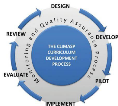
Fig.1 The CLIMASP Curriculum Development Process [12]

The number of courses to be taken by undergraduate students, including the capstone course to qualify for the CLIMASP minor are weighted 60 ECTS. Students will be provided a formal credential through transcript documentation (Euro-Arabpass) adapting the Europass diploma to certify that they have developed leadership in the field of climate change and sustainability policy [10], [11].