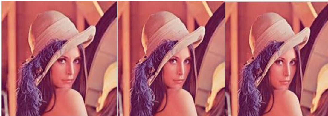
Figure 2: (a) Original Image 'Lena'; reconstructed image (8×8 block) using (b) BTC, (c) MBTC