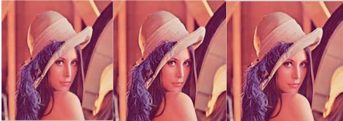
Figure 1: (a) Original Image 'Lena'; reconstructed image (4×4 block) using (b) BTC, (c) MBTC