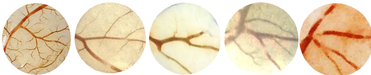
Figure 1(a). Inhibitory effects of water extracts of O. welwitschii and T. oppositifolium on angiogenesis.

Control (PBS) Water extract of Oncoba welwitschii Water extract of Tetrorchidium oppositifolium 0.25 mg/mL 0.50 mg/mL 0.25 mg/mL 0.50 mg/mL