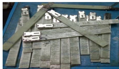
Fig. 3a – Tray (on left), 3b - Prepared Glass fiber laminates (on right) Fig. 4 Prepared specimens of Glass Epoxy Laminate after cutting