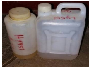
Fig. 2 Epoxy resin and hardener

A substance added to control the degree of hardness of the cured film. It is also a substance or mixture added to plastic composition to promote or control the curing action by taking part in it.