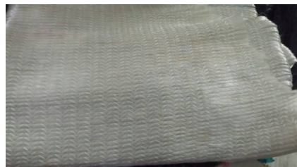
Fig. 1 Glass fiber

Fiber glass has a white color and is available as a dry fiber fabric as shown in Fig.1. It has good strength & electrical resistivity. It is used in circuit boards of computers to provide stiffness and electrical resistance. Because of electrical resistance it is suited for applications where radio-signal transparency is desired in aircraft redoes and antenna. It has a specific gravity 2.54g/cc and a melting point 1555°F( 846°C). Refract. Index is 1.547