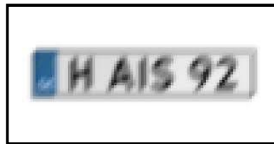
Fig.2. blur image of license plate

The image of the blur license plate is given as input to the system for pre-processing. The image of the blur license plate is given below.