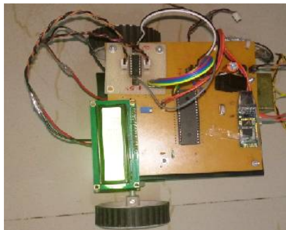
Fig 2. Raspberry Pi Specifications