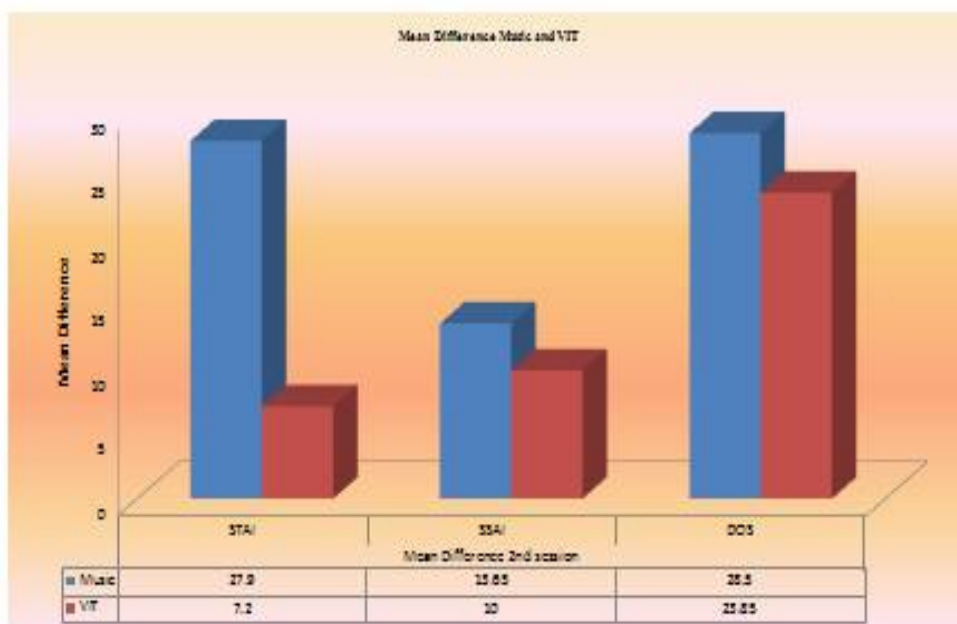
Graph No 3.3 Graphical representation of Mean Difference Between MT & VIT

The level of significance in MT for SSAI,STAI and dyspnea shows p=0.0001 and in VIT the p value for SSAI is 0.0003 ,STAI is 0.0001 and dyspnea scale is 0.0002.The MT group showed to be statistically significant in reducing anxiety and depression in moderate COPD patients.