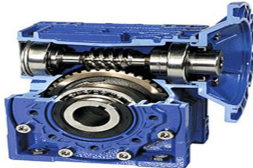
Figure 1: Worm and worm wheel gearbox

We have used worm and worm wheel gearbox for speed reduction. Superior in quality, efficiency and performance, the range of worm gearbox are available in various features and specifications such as horizontal, vertical and shaft mounted type.