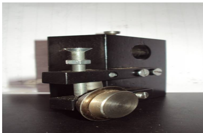
Figure 5: Half Cut Sticker Cutting Operation

In our machine the operation is carried out named as half cut sticker label cutting machine. It is very precise operation; the accurate pressure is required to perform this operation.