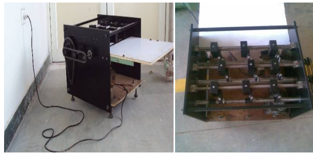
Figure 2: Half Cutting, Creasing and Perforation machine

When electric supply is start the motor is turn on. The motor is coupled with gear box with the help of coupling, Hence output shaft of gear box is rotated . The drive is transferred to the rollers with the help of chain drive, the chain which is on the sprocket hence rollers are rotated .The motor is rotated in clockwise direction and gearbox output shaft is rotated in anticlockwise direction of roller which is transferred from gearbox output shaft paper is moved in forward direction. The rollers which are mounted on bracket are guided the paper, brackets are guided the paper brackets are placed on the shaft we can change the position of the bracket as per requirement.