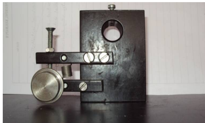
Figure 3: Creasing Operation

A Creasing operation is used to fold the file. In our machine the creasing cutter is rest at the third shaft or last shaft. Firstly the paper is passed over shaft 1 and fiber rollers are guided to this paper then paper is moving in forward direction, after that paper is passed between the groove of creasing bar and that time creasing cutter apply pressure on the paper. Hence the folding operation is carried out. The pressure on the paper is adjusted manually.