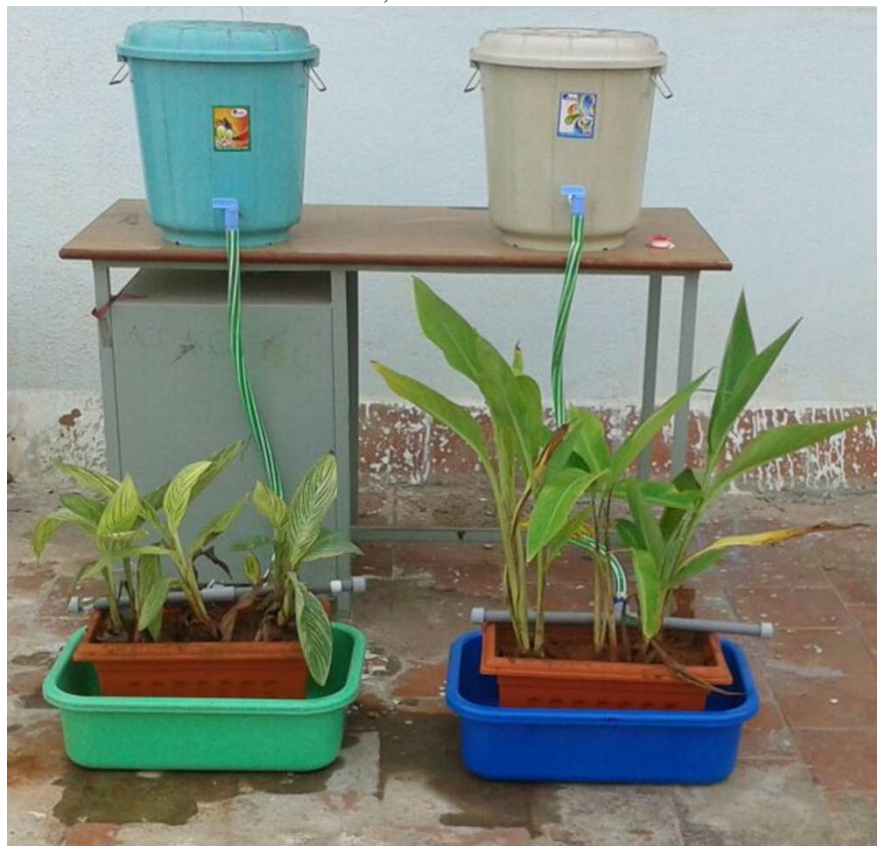
Figure 1- Experimental Setup

The experiment was carried out from July 2016 to September 2016 and two pilot scale units were fed with fresh water for a period of one month. The untreated wastewater from campus were collected and analysed for various parameters. Then the greywater is allowed to flow over the canna plant bed for its treatment. The greywater is fed over the plant and the water collected after treatment is taken for tests such BOD,COD and TSS.