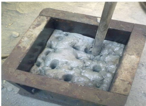
FIG 1.1 GEOPOLYMER CONCRETE