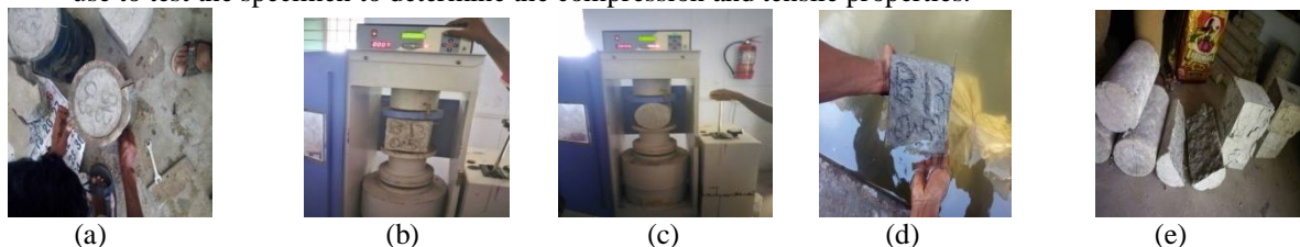
Fig1. Experimental results (a)Demoulding (b)compression strength(c)split tensile(d)curing(e)After testing

After 28 days curing period, the specimen are ready for test. The standard CTM (Compression Testing Machine) was use to test the specimen to determine the compression and tensile properties.