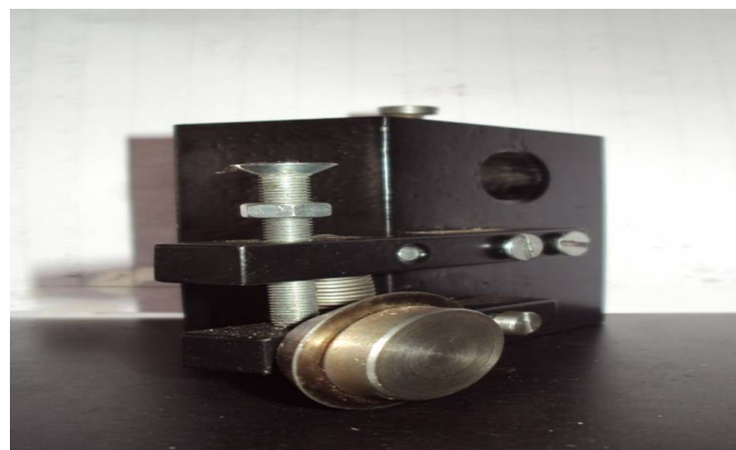
Figure 5: Half Cut Sticker Cutting Operation

In our machine the operation is carried out named as half cut sticker label cutting machine. It is very precise operation; the accurate pressure is required to perform this operation.