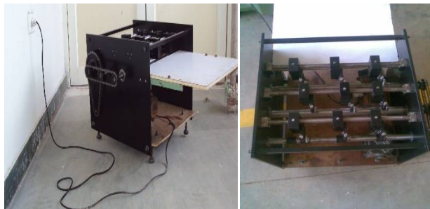
Figure 2: Half Cutting, Creasing and Perforation machine

When electric supply is start the motor is turn on. The motor is coupled with gear box with the help of coupling, Hence output shaft of gear box is rotated . The drive is transferred to the rollers with the help of chain drive, the chain which is on the sprocket hence rollers are rotated .The motor is rotated in clockwise direction and gearbox output shaft is rotated in anticlockwise direction of roller which is transferred from gearbox output shaft paper is moved in forward direction. The rollers which are mounted on bracket are guided the paper, brackets are guided the paper brackets are placed on the shaft we can change the position of the bracket as per requirement.