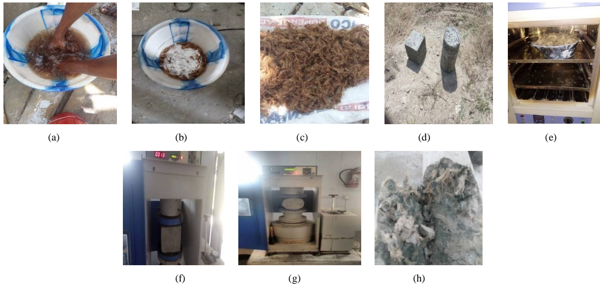
Fig.3. Experimental Results (a) Treatment of jute with NaOH (b) Treatment of jute with polymer latex (c) Treated jute (d) Sample specimens (d) Oven Drying (e) Compression strength test (f) Split tensile test (h) Sample after testing

After the 7 days curing period, the specimens are ready for test. The standard CTM (Compression Testing Machine) was used to test the specimen to determine the compression and its tensile properties.