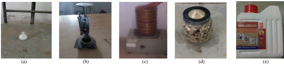
Fig. 1. Test Materials and their properties (a) Le-Chateliars flask (b) Vicat Apparatus (c) Sieve Shaker

(d) Specific Gravity of Jute using Pycnometer (e) Polymer latex (SBR)