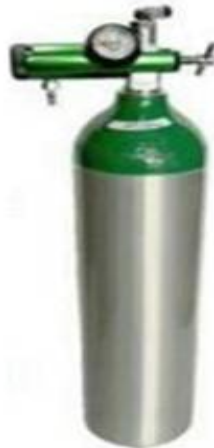
FIG 5 : STORAGE TANK