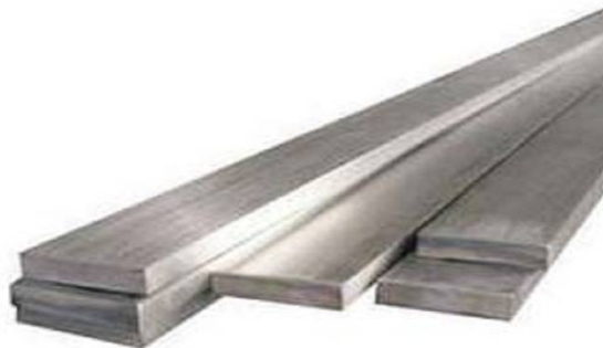
Fig 4: IRON PLATES

Nickel is a hard silver white metal .It forms cubic crystals. It is malleable and ductile. It has superior strength and corrosion resistance. The metal is a fair conductor of heat and electricity. It exhibits magnetic properties below 345° C.