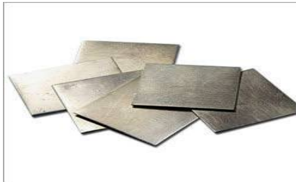
Fig 3: NICKEL PLATES

Nickel and iron plates are used as electrodes in this electrolysis process for the production of more amount of oxygen for a long period of time and they provide a continuous steady supply of oxygen for the requirement of mixture with fuel to give a complete combustion of the fuel.