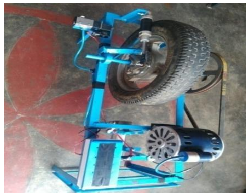
Fig 3.1 Experimental Setup

The IR Transmitter circuit is to transmit the Infra-Red rays. If any obstacle is there in a path, the Infra-Red rays reflected. This reflected Infra-Red rays are received by the receiver circuit is called "IR RECEIVER". The IR receiver circuit receives the reflected IR rays and giving the control signal to the control circuit..