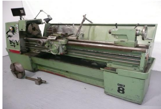
Figure1. Lathe Machine setup