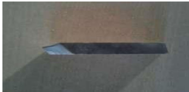
Figure2. cutting tool

Single point carbide tool was used for machining. Photographic view of tool is given below and physical properties of carbide tool are given in table.3