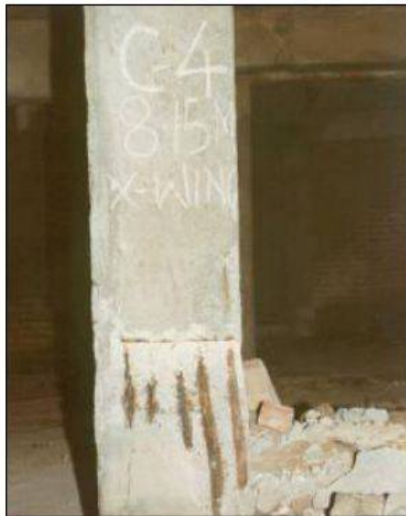
Fig No 02 RUST Sign in RCC Coloumn