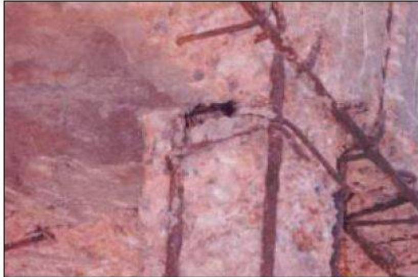
Fig No 03 Huney Combed Coloumns Beam- Junction