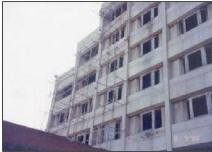
Fig No 01 Closer View of Rehalilitaion Building