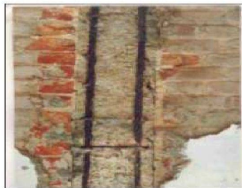
Fig.No-4 Spalled cover concrete & exposed cover Reinforcement