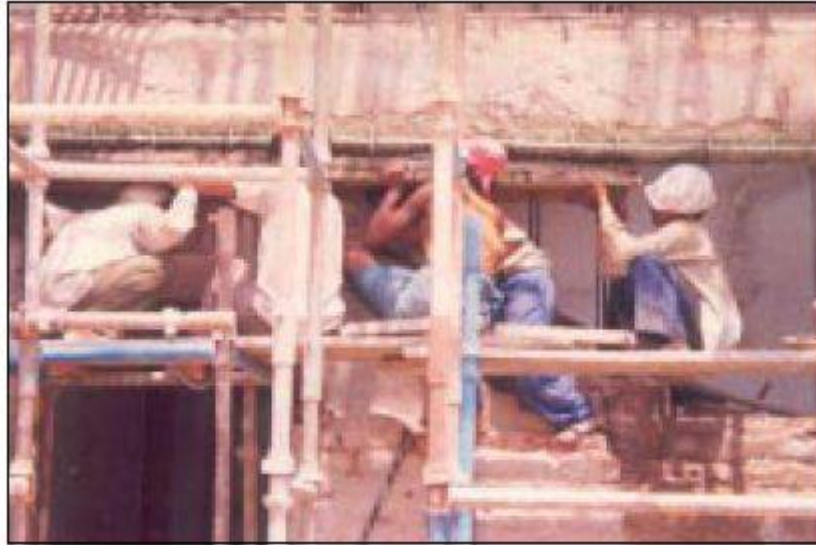
Fig No 05 Repair Material RCC Beam.