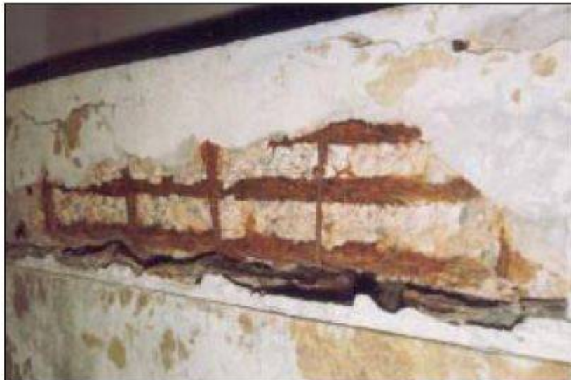
Fig No 04 Expansion Joint Location