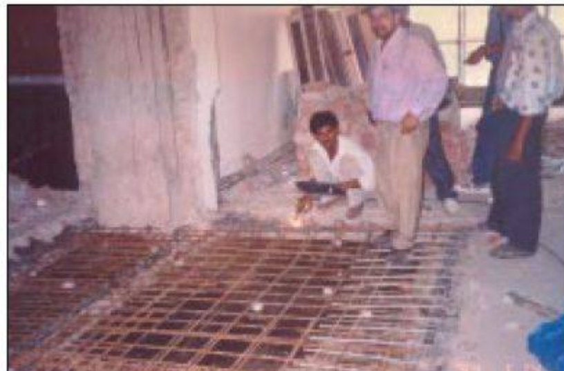
Fig No 06 Recasting RCC Slab