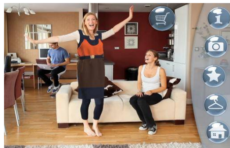
Figure 2 - Static Clothing

The introduction of the Camera made it relatively easy and cheap to get access to a depth sensor. Using the depth sensor with open source middleware such as OpenNI Framework made it possible to track the user's pose quite accurately [5]. One such application was that of Fitting Reality which used the Camera to create a Shape ID of the user. The Shape ID would store the measurement and size of the user. And finally static clothing would be rendered on the user [Figure 2].