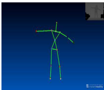
Figure 4 Skeleton Tracking

The joints tracked are joined with lines which represent the major bones of the tracked skeleton. The depth map uses the input from the IR cameras; the texture map is the RGB color map of the scene that can be recorded just like any RGB cameras. The user map is an output of binary images that would include the detected people in the scene.