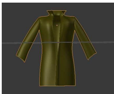
Figure 3 - 3D Mesh

One of the primary goal of a virtual dressing room is to give a realistic visual experience of trying on different garments. Beside the alignment of the clothing, the realism of the clothing movement is an important aspect in providing this experience. Different materials have a different feel to them. For example, silk will move much more freely as compared to leather. In the first versions the clothes were just static 2D images [6]. It was only possible to see how the clothes looked from the front. In more advanced dressing rooms such as the one created by FaceCake multiple 2D images of the clothing from different angles provided a more realistic experience, as it was possible to turn around and have a look from different sides. However, the clothing is still static and there is completely no interaction with the clothes besides changing its location, rotation and scale. Compared to our approach which uses 3D models of clothes designed using Blender [Figure 3], the current approach of using 2D images is limited in several ways. Since the clothing is photographed from a limited number of angles it does not rotate smoothly, but in fixed intervals, while a 3D model can be rotated freely. Furthermore, cloth simulation can be performed on a 3D model making it move and fold as a reaction to the user's movement and thus allowing physical interaction between the virtual clothing and the user avatar, something which is not possible with 2D images.