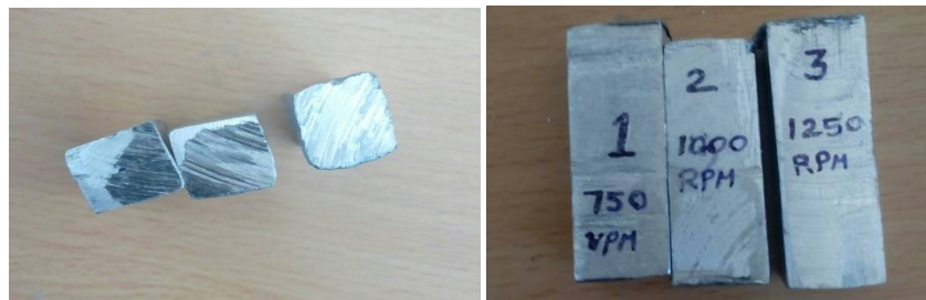
Fig 6 Specimens of Wear Test

The dry sliding wear tests were performed on pin-on-disc apparatus. Wear test samples were made of size \phi 7 \times 50 mm. The rotating disc material is made of EN-31 steel with the hardness of 63 HRC. Sliding wear tests were conducted on track diameter 15mm with load 10N, sliding speed 0.314 m/s and sliding distance 113.097 m. The dry sliding wear was observed by measuring weight loss. Weight loss of pins was converted into volume loss using density of specimens. Fig.6 shows the specimens used for wear tests. Table III shows Wear rate, Specific Wear rate and Coefficient of Friction.