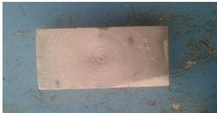
Fig 4 specimens of hardness test

Table I shows the hardness of the composites. Among the different specimen, Al6063 reinforced with 10% Boron and 5% Graphite has the highest hardness of 38 BHN. But for Al6063 5% Boron carbide, 5% Graphite Hardness value decreases to 34 BHN.