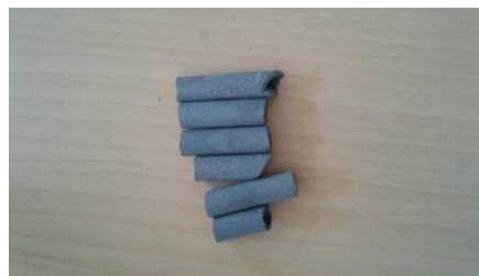
Fig 2 Silicon Carbide

Silicon carbide is also know as carborundum is a compound of silicon and carbon with chemical formula SiC. It occurs in nature as the extremely rare mineral moissanite. Synthetic silicon carbide powder as been mass produced for use as an abrasives grains of silicon carbide can be bonded together by sintering to form very hard ceramics that are widely used in applications requiring high endurance such as car brakes, car clutches and ceramic plates in bullet proofs vests. Electronic application of silicon carbide such as light emitting diodes and detectors in early radios where demonstrated .SiC is used in semiconductor electronic device that operate at high temperature large single crystals of silicon carbide can be grown with lely method they can be cut into gems know as synthetic moissaite. Silicon carbide with high surface area can be produced from SiO 2 contained in plant material.Silicon carbide possesses interesting electrical properties due to its semiconductive characteristics, the resistance of different compositions varying by as much as seven orders of magnitude. In addition high hardness, corrosion resistance and stiffness lead to wide range of applications where wear and corrosion resistance are primary performance requirements. It displays good thermal shock resistance and refractory material (high melting point). It has excellent thermal conductivity and low thermal expansion consequently. Fig. 2 shows.