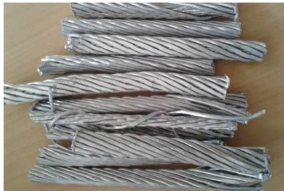
Fig 1 Aluminium

attack by fuels and solvents, and the ability to be formed and treated on conventional equipment. It possesses excellent casting properties and reasonable strength. Aluminium is a chemical element in the boron group with symbol AL and atomic number 13 and it is silvery-white, soft, non magnetic, ductile material by mass aluminium makes up about 8% of earth crust. Aluminium is remarkable for metals low density and it's ability to resist corrosion through the phenomenon of passivation. aluminium and it's alloy are vital to the aerospace industry and important in transportation and structures , such as building facades and window frame. The oxides and sulfates are the most usefull compound of aluminium.This alloy is best suited for mass production of lightweight metal castings. Fig. 1 shows Aluminium.