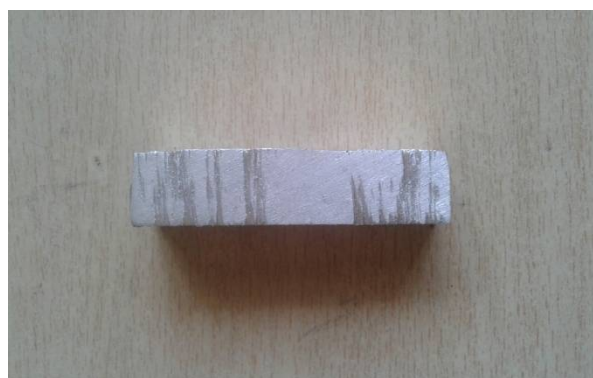
Fig 5 Specimens of Impact Testing

In an impact test a notched bar of material, arranged either as a cantilever or as a simply supported beam, is broken by a single blow in such a way that the total energy required to fracture it may be determined. The energy required to fracture a material is of importance in cases of -shock loading when a component or structure may be required to absorb the K.E of a moving object. Energy absorbed is the energy which is absorbed by the material. The energy is calculated in joules. The energy absorbed is calculated the energy available at the end. The energy absorbed can be found with the help of Charpy impact tests. The standard specimen size for Charpy impact testing is 10mm×10mm×55mm. Fig.5 shows the specimens of Impact testing.