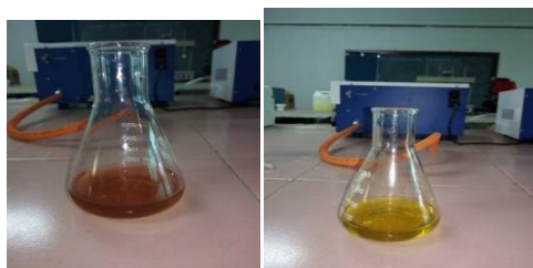
INITIAL fig(3) FINAL fig (4)

To find out the concentration of ammonical nitrogen in the water sample the test is conducted as per standard procedure. The initial value of the test is orange in color as shown in fig (3). Then the water is titrated against 2N sulphuric acid the sample water turns from orange to yellow as result as shown in fig (4)