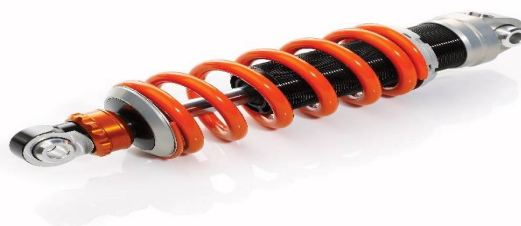
a. Coil spring shock absorber

Coil spring shock absorbers are used nowadays in most of the commercial two wheelers. This type of shock absorber consists of spring steel helical coil and piston with hydraulic type. It is generally made by open coil helical spring for compression purpose. Hence it is known as compression coil spring suspension.