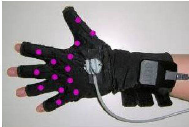
Figure 1 Glove Based System.

The Data glove construct using optical and mechanical sensor connect to a glove which will convert finger flexion's into some electrical signals for identifying the hand posture. This technique blocks the ease of naturalness of the human interaction because it complex to carry load of cable which will be connected to the machine and the instrument is very expensive and difficult to handle. Fig. 1 Show the Glove Based System.