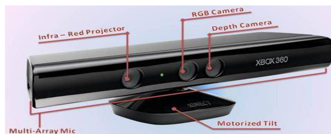
Figure 4 Kinect Device

Kinect Device [1] is developed by Primes Sense Firm which acquires 3D sensing Technology. It consists of various components in it like IR camera, Color Camera and infrared Projector. The IR camera is used for distance ranging device like the camera autofocus works.