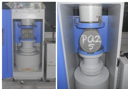
Fig. 1. Experimental Setup