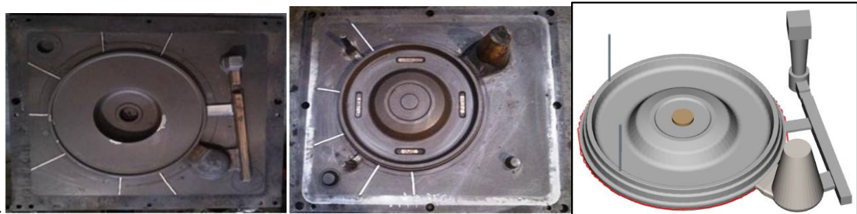
Fig. 1: Pattern and 3D model of existing gating system.

Existing gating system is as shown in following figure 1. Here sprue is connected to runner and runner is connected to casting with two ingates one ingate is connected through feeder for compensation of shrinkage. This design is having two vents on outer part for removal of gases and table 1 shows the process details for existing gating system.