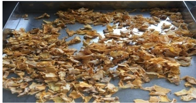
Fig. 4. Oven-dried Pumpkin

There after pumpkin strips were pulverized into a fine powder in a blender, so we obtained pulverized pumpkin powder about 208 gram as shown in Fig.5. Then after the pumpkin powder was sieved using a 75 \mu m sieve and we observed 48 gram homogeneous pumpkin mixture was able to pass through it.