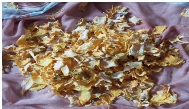
Fig. 3. Sun-dried Pumpkin

First of all the strips were sun dried for two days for the duration of 8 hour a day as shown in Fig.3.