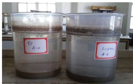
Fig. 8. Wastewater sample treated with Activated carbon

Same way, we prepared two samples of wastewater treated with activated carbon as shown in Fig.8. Then after, two samples were kept as it is for duration of 24 hours as the particles were settle down and at the bottom of container sludge was formed.