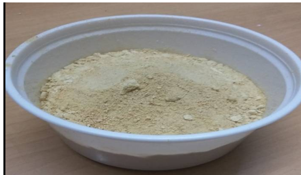
Fig. 5. Pulverized Pumpkin Powder

There after pumpkin strips were pulverized into a fine powder in a blender, so we obtained pulverized pumpkin powder about 208 gram as shown in Fig.5. Then after the pumpkin powder was sieved using a 75 \mu m sieve and we observed 48 gram homogeneous pumpkin mixture was able to pass through it.