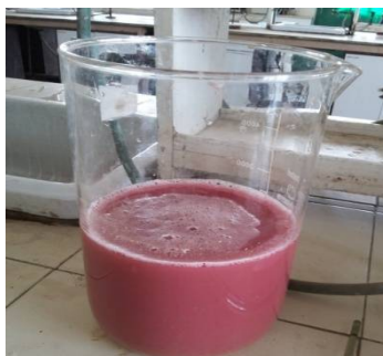
Fig. 1. Synthetic waste water

It was very difficult to arrange the industrial waste water containing heavy metals, so we prepared the synthetic waste water as shown in Fig.1.