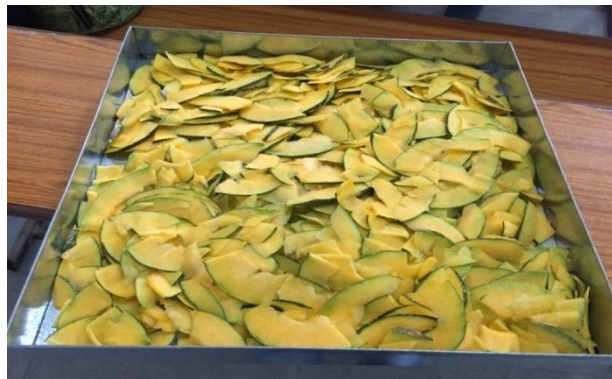
Fig. 2. Pumpkin Slice

As we were used pumpkin as a bio-sorbent, pumpkin of 3 kg was obtained from market and washed properly. After removing stems, seeds, and inner membranes, pumpkin was sectioned and sliced into strips of approximately 0.125 inches each. Fig.2. represents the sliced pumpkin is given below.