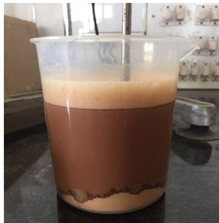
Fig. 7. Wastewater sample mixing by using electric stirrer

First we converted an activated carbon particles into pulverized form. Then after the fine powder of activated carbon was divided into two proportion of 5g & 10g which was added in 500ml of two different sample containing synthetic waste water. Then the samples were mixed by using electric stirrer for 10 minutes. Fig. 7. represents the proper mixing of sample by using electric stirrer.