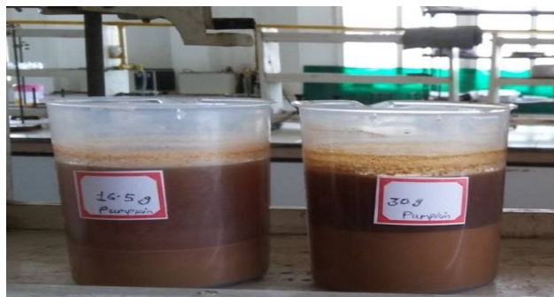
Fig. 6. Wastewater sample treated with Pumpkin Powder

Further, 48 grams of pumpkin powder was divided into two proportions of 16.5g & 30g and were mixed thoroughly in containers containing 500ml of waste water. So we got two samples of wastewater treated with pumpkin powder as shown in Fig.6. Then the samples were mixed by using stirrer for 10 minutes. After that, samples were kept as it is for 24 hours, to let settle down the particles and at the end, sludge was formed at bottom of the containers.