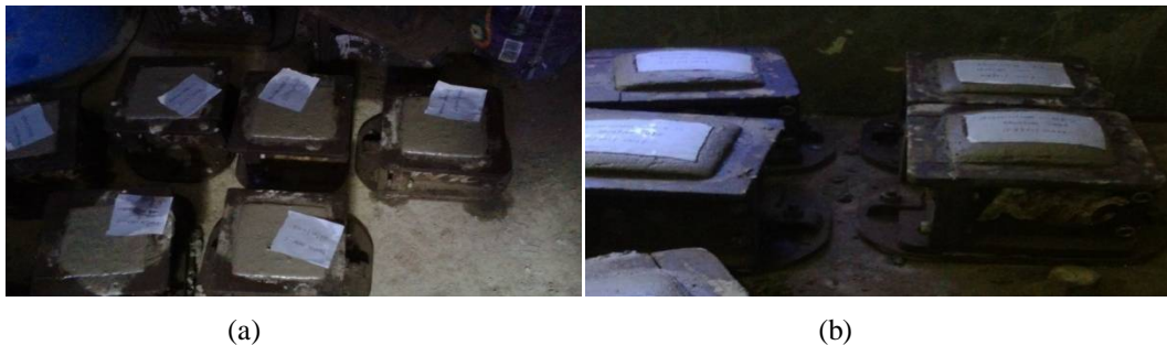
Fig.3.(a) Concrete during hydrogen evolution process. (b) Concrete after setting.