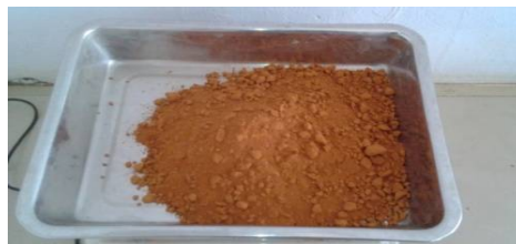
Fig.1. Crushed clay brick

River sand are depleting day by day and we have to go for other alternatives. Crushed clay bricks are easily available, and can be used as fine aggregate, which is shown in the figure 1. Nowadays cellular (aerated/formed) concrete is widely used because of its unique characteristics. Lot of researches have been reported to evaluate the potential of using crushed clay bricks as an alternative aggregate. Most current researches use crushed clay brick as a coarse and/or fine aggregate in conventional concrete. Few researches reported that crushed brick powder could be used as partial replacement of fine aggregate in concrete. Recycling crushed clay brick wastes needs more researches to make the use of these wastes. Producing aerated concrete with crushed clay brick as an alternative to fine aggregate will present solution for these recyclable wastes.