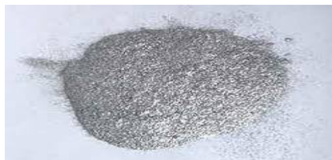
Fig.2 Aluminium metal powder.

Cellular concrete can be produced by cement and lime as calcareous materials and by quartz sand as the siliceous materials with traces of aluminium powder as a pore forming agent. Figure 2 shows the aluminium metal powder. After mixing these components with water, aluminium powder reacts with calcium hydroxide which liberates hydrogen gas and forms bubbles that lead to a porous structure concrete. The use of the correct amount of air entraining agent is very important. Air entraining agents produce countless tiny air bubbles that reduce the density of the concrete and contribute to the insulation values. These bubbles also help to prevent cracking and damage from freeze/thaw cycles. They do this by absorbing the effects of the concrete expanding and contracting. When adding air entraining agents, generally the intent is to create approximately 8-15% air in the final mix. Fine, uniform, smooth metallic powder free from aggregates available from market is used in this research and it has an atomic weight of 26.98.