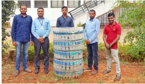
Figure 5: Implementation in the college campus.