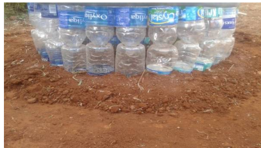
Figure 3: Actual Photographs of Model