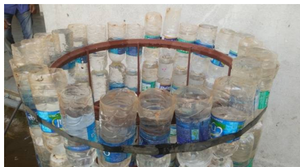
Figure 4: Bottles Full of Water

The last layer of bottles is inserted into ground about 10 to 12 cm to ensure that the water seeps through vertical direction only which in turn results in increase in ground water table.