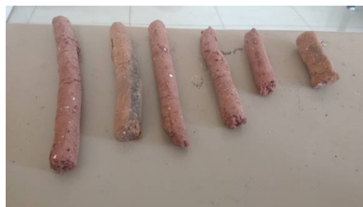
Figure 1: Construction of Brick-Mud Cocks

Interconnecting bottles by making hole at bottom of bottle and inserting another bottle into it, in this way a series of 5 bottles were made. Such 27 series were made to ensure the requirement. Side by side the upper portion of upper layer of bottle is cut down horizontally which makes path to enter rainwater as well as through conventional means. By changing the capacity of bottles (500 ml, 1litre, 2 liters etc) or by modifying the numbers of bottles attached to frame, the total water carrying capacity of safe guard tree can be modified.