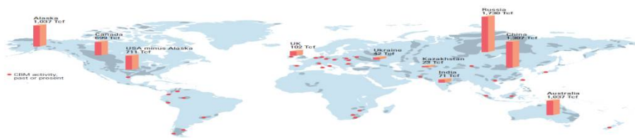
Fig.1 CBM reservoir and global activity

The Government of India has received overwhelming responses from prospective producers with several big players starting operations on exploration and development of CBM in India and set to become the fourth after US, Australia and China in terms of exploration and production of coalbed methane [3, 4]. CBM major activity worldwide enlisted in figure no.1. Major CBM reserves (dark grey) are found in Russia, the USA (Alaska alone has an estimated 1,037 Tcf), China, Australia, Canada, the UK, India, Ukraine and Kazakhstan of the 69 countries with the majority of coal reserves, 61% have recorded some form of CBM activity- investigation, testing or production. (US DOE, reference, and BP Statistical Review, [4])