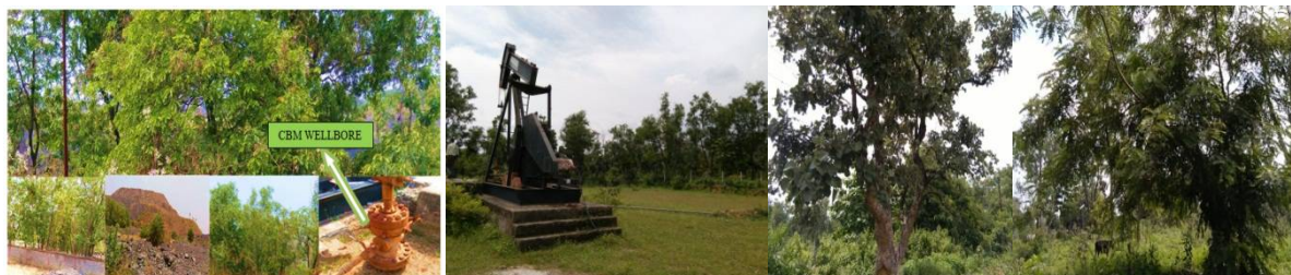
Fig.7, Local vegetation around CBM site

The coalfield lies in the sub humid belt of Jharkhand and the climate is extreme in this region. The maximum temperature during summer (April to middle of June) rises up to 46°C to 48°C while during winter (December to January) the mercury often drops to 5 °C to 7 °C. The eastern monsoon usually breaks out during the second fortnight of June with maximum precipitation in the months of June to September. The area is fairly vegetated with shrubs of Lentana and at places Dhotras . Trees like Mahua , Palas , Bair , Pipal , Shishu , Karanj , Mango and Banyan are common most abundant being Palas . Vegetation at CBM site, shown in figure, 7