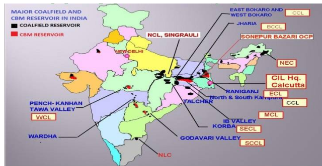
Fig.2 Coal and CBM reservoir in Indian state and working company

India having the fourth largest proven coal reserves in the world holds significant prospects for exploitation of CBM. However no assessment about total prognosticated CBM resources in the country including CIL mining lease areas is available. The MoPNG in consultation with Ministry of Coal and CMPDI has identified 26000 sq km of area for CBM operation. Total estimated CBM Resources in this identified area is about 2600 BCM (91.8 TCF). Jharkhand is one of the richest resources of CBM 722.08 BCM (25.5 TCF) [4]. In Jharkhand CBM exploration in high pick due to huge Coal reservoir especially in Jharia block of Dhanbad district.