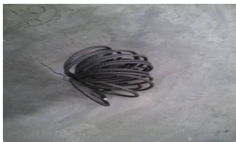
Fig -2: Circular stirrups

The size of stub column includes 150 mm diameter, 300 mm height with using 3 circular stirrups and 6 steel tubes. The diameter of the steel tube taken as 6 mm with spacing of each rod was 75 mm. The compressive strength achieved for ordinary reinforced concrete column was 30.7 MPa whereas for composite reinforced column was 34.98 Mpa.