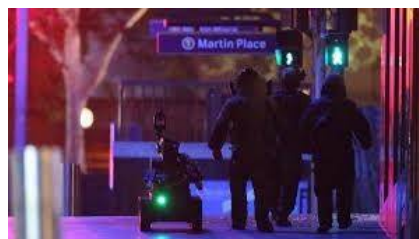
Fig.1: Robotic vehicle used in military

The advent of technology has brought a revolutionary change in the field of robotics and automation which ranges in all the sectors from household domestic works to the defence sector. Today in the global market, smart phones also have brought a revolution in changing people's lifestyle and providing numerous applications on different operating systems. Android operating system is one of these systems build on open source which has made a huge impact providing many applications for robotics to help people in their day to day life.