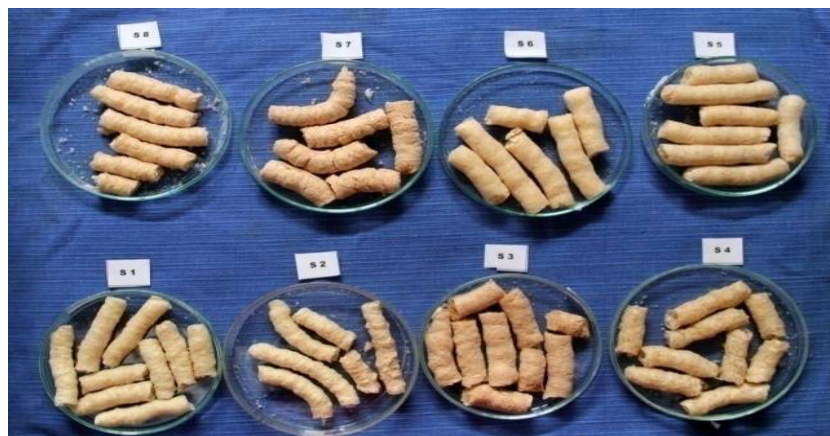
Plate 1: Rice based extrudates of lentil and oat