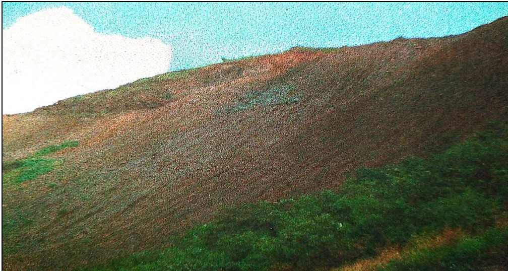
Fig. 2B Iron Ore Fines stacking at foot hill near N E B Range