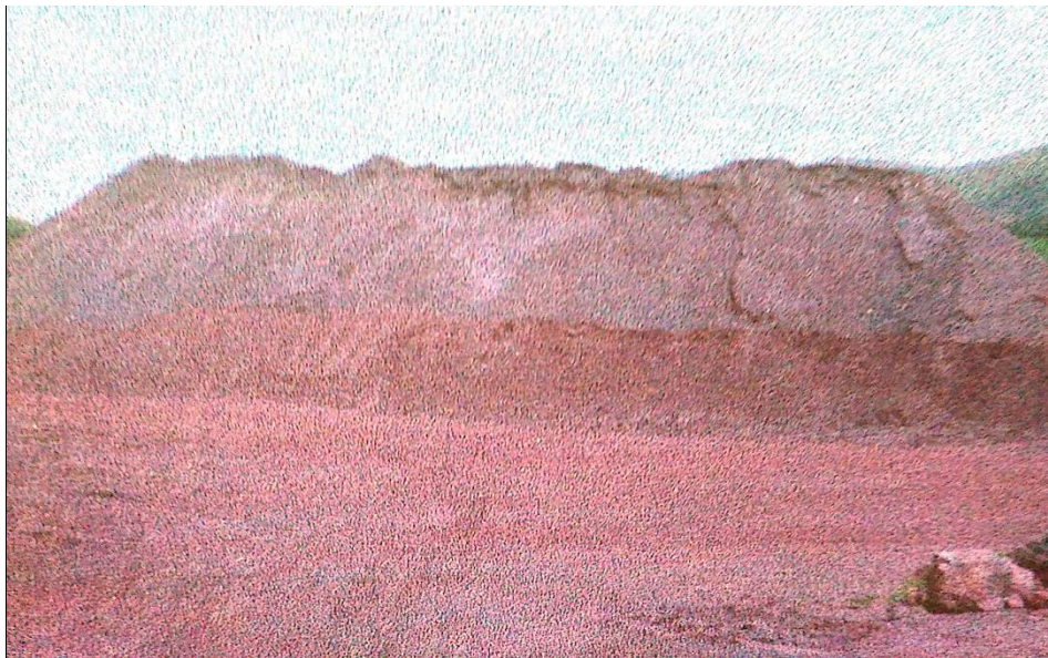
Table .1 Location and Chemical analysis details of stream sediments.