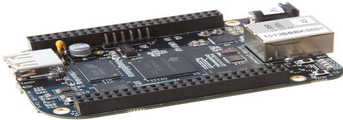
Fig 2: Beagle Bone Black

The Beagle Bone Black is the latest addition to the BeagleBoard.org family and like its predecessors, is designed to address the Open Source Community, early adopters, and anyone interested in a low cost ARM Cortex-A8 based processor. It has been equipped with a minimum set of features to allow the user to experience the power of the processor and is not intended as a full development platform as many of the features and interfaces supplied by the processor are not accessible from the Beagle Bone Black via onboard support of some interfaces. It is not a complete product designed to do any particular function. It is a foundation for experimentation and learning how to program the processor and to access the peripherals by the creation of your own software and hardware.