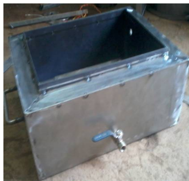
Preparation of Oil Tank

Material used: mild steel Operations: Bending, welding, grinding, insulation