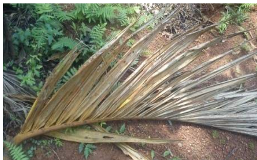
Figure1: Areca Leaf

Areca leaves are found in abundance in the state of Karnataka. Being a common biomass material in majority of the rural areas, in this section, the briquetting of areca leaves is studied and respective analysis has been done. Figure 1 illustrates a sample leaf of the areca tree. In order to prepare the briquettes, a residual sample of the areca leaves was cut and dried in the open sun so as to eliminate the presence of moisture from it. The dried residue was subjected to size reduction by making them pass through a hammer mill. The milled areca leaves were sieved using ASTM E11 [105] and particle sizes of 1700 \mu and above, 850 \mu , 600 \mu , and 425 \mu were selected for the purpose of briquetting as shown in Figure 2.