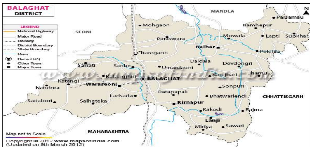
Figure no.3: District Balaghat, Madhya Pradesh at a glance

The present paper stresses the teak plantation and forest in Madhya Pradesh agro-climatic zone Chhatisgarh plain, Balaghat ( Fig.3 ). Balaghat District is located in the southern part of Jabalpur Division. It occupies the south eastern portion of the Satpura Range and the upper valley of the Wainganga River. The district extends from 21°19' to 22°24' north latitude and 79°31' to 81°3' east longitude. The total area of the district is 9,245 km 2 ( Fig.4 ).