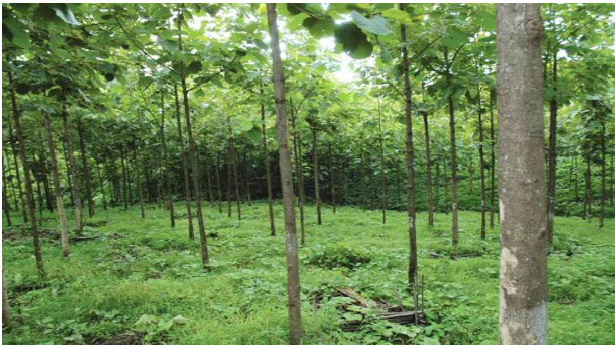
Figure no.1: Teak plantation area.

Carbon management in forest plantations will probably be the single most important agenda of the first half of the 21st century in India in the context of the greenhouse effect and mitigation of global climatic changes. Today teak ( Tectona grandis ) is widely planted in most of the district of Madhya Pradesh and having forest as an exotic species. This teak based global sink would certainly increase because during the past 20 years most supplies of teak wood from natural forests have dwindled and increased interest has developed in the establishment of teak forest plantations (Fig.1).