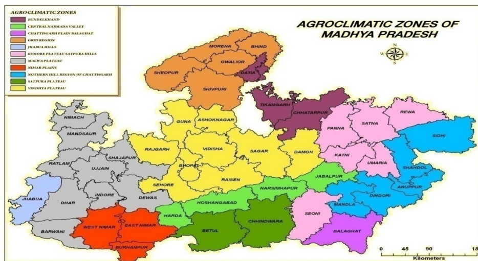
Figure no. 2. Showing different Agro-climatic zones of Madhya Pradesh.

Teak has the highest capacity for carbon sequestration among trees in India (157). Carbon dioxide traps heat and is the main villain insofar as global warming is concerned. Carbon sequestration is the process by which carbon dioxide is captured from the atmosphere by trees for long-term storage and in its lifetime, a teak tree absorbs 3.70 lakh tonnes of carbon dioxide from the atmosphere (158). This paper describes the teak plantation botanical features, agronomical details for its sustainable existence in district Balaghat, Madhya Pradesh. The agro-climatic suitability for teak plantations has been shown in Fig.2 :