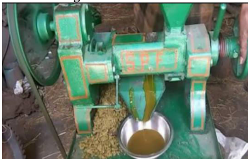
Fig 2: Extraction of algae oil from mini oil expeller.

The samples were spread under the sun in an open area for 24 hours to evaporate the moisture present in it. The algae sample were collected was about 40kg, when it was dried it became 30kg. The dried algae were put into the mini oil expeller (as shown in fig 2). The oil was obtained about 500ml.