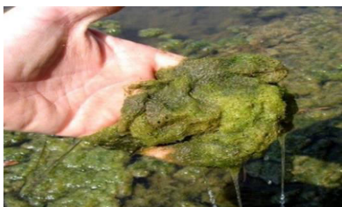
Fig 1: Algae sample collected from Baathilake and surroundings.

The algae sample was formed thick film on or under the surface of the water which have been collected by using net. Since it was grown on the shallow water surface of lake. This kind of filamentous algae has a coarse texture to it hence often referred to as horse hair. The algae samples (Fig 1) were collected from Davangere district of Baathilake and surrounding places, Karnataka state, India. The algae bloom was formed as thick mat on the surface of water.