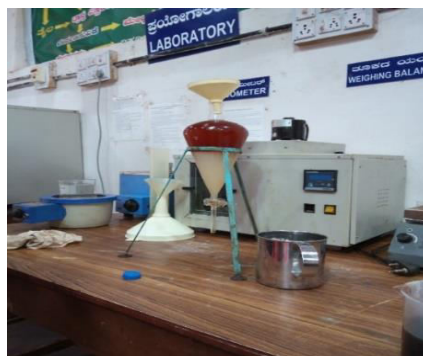
Fig 5: Washing of Biodiesel with water.