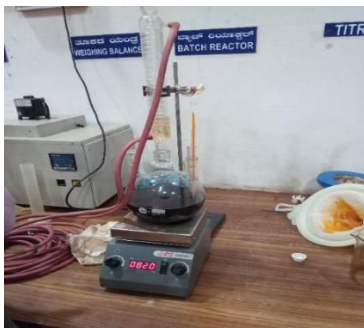
Fig 3: Oil heating in 3-neck flask.