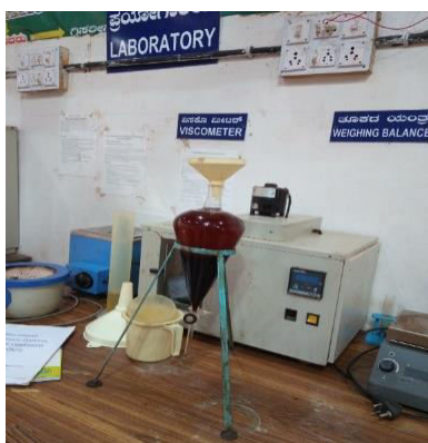
Fig 4: Separation of biodiesel and glycerine.