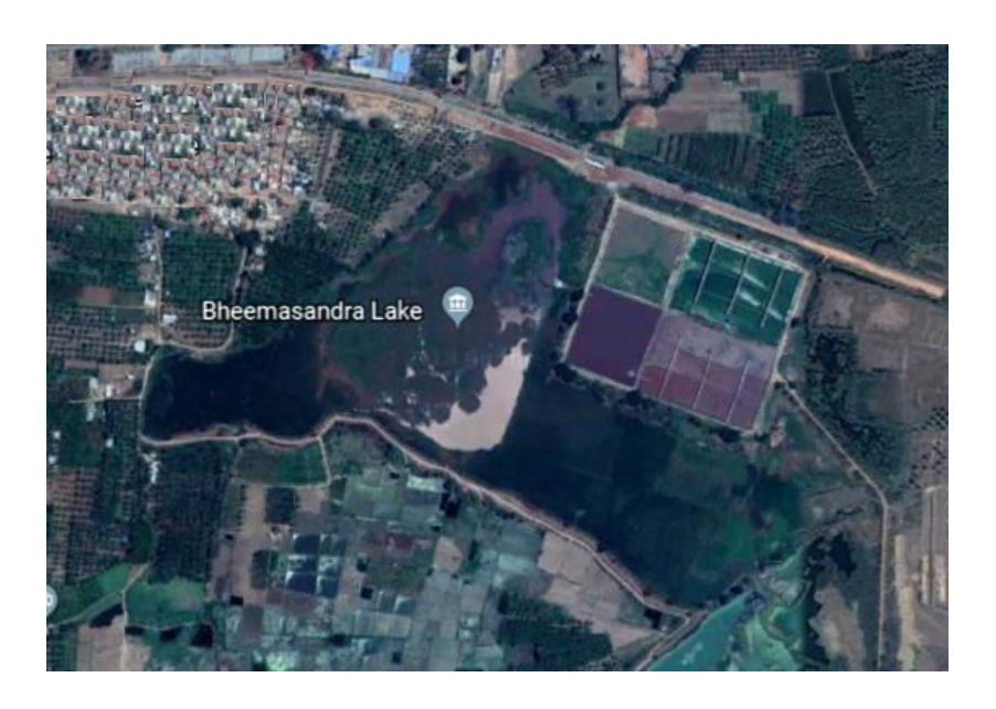
Fig 1: Satellite View of Bhimasandra Pond

The study was carried out at Bhimasandra pond which is geographically located in between 13°20′ 37" N 77°03′59". It is in the 860 meters to 678 meters elevation range (Fig-1)