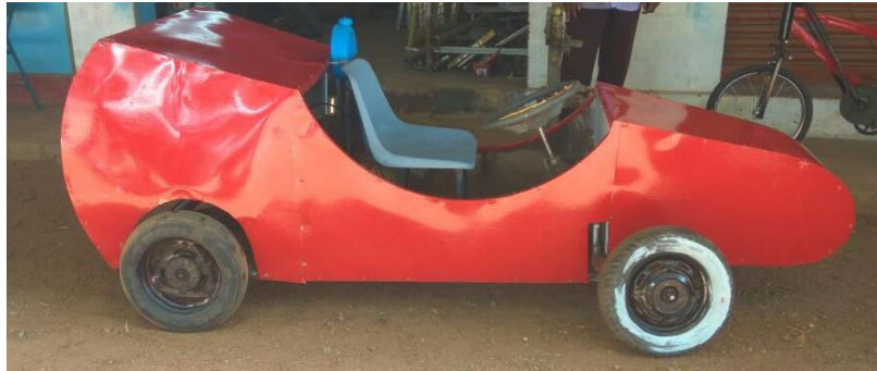
Fig.3: Hybrid Car