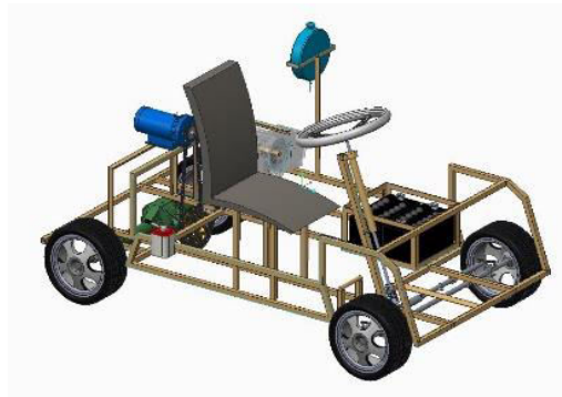
Fig.1: Sample 3D drawing of hybrid car

Fig.1 shows the 3D CAD design of Hybrid car. High-end CAD/CAE software's are for the complete modelling, analysis and manufacturing of products. High-end systems can be visualized as the brain of concurrent engineering. The design and development of products, which took years in the past to complete, is now made in days with the help of high-end CAD/CAE systems and concurrent engineering.