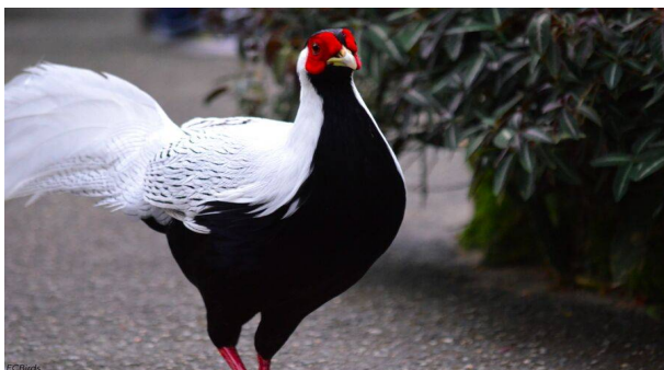
Male Silver Pheasant ( Lophura-nycthemera )

Pheasants belong to a family 'Phasianidae', order 'Galliformes' that includes some of the most beautiful birds in the world such as the Golden pheasant, famous in Chinese art, have delighted and benefited man for centuries but sadly many of them are today under threat as a result of his activities. There are forty-eight different species of pheasants, according to the IUCN. Red list of Threatened spp. Behaviour of silver pheasant is largely directed towards self and racial-survival. It is an internally directed system of activities, which strives to maintain the physiological stability of the body in the face of many environmental hazards, such as heat & cold, sun and rain, lack of food, competition, predators and parasites. It is also a system that, through reproductive behaviour, tends to guarantee the continuation of the species. Behaviour is influenced by many factors such as harmones, nutritions, periodic physiological cycles, age and maturation and particularly the past experiences of the individual year.