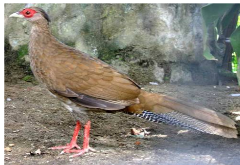
Female Silver Pheasant ( Lophura-nycthemera )