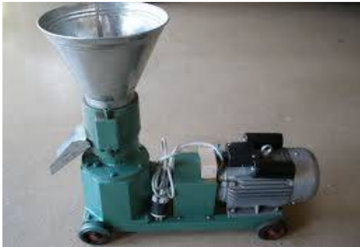
Fig 2: Dusting Equipment

The solar plate trappers, traps the solar energy and the power is stored in the battery. This power is used to drive the system. The switch is on and the power is given to drive system which operates the rotary fan. The powder to be spray falls down in front of the rotary fan by mean of air pressure the powder is forced out of the pipe. The adjusting rod is used to adjust the powder falling from the powder container according to requirement.