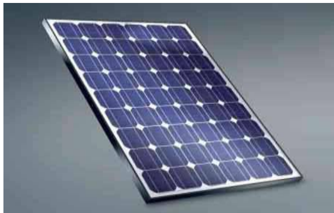
Fig 4: Solar Panel

A solar panel (also solar module , photovoltaic module or photovoltaic panel ) is a packaged, connected assembly of photovoltaic cells. The solar panel can be used as a component of a larger photovoltaic system to generate and supply electricity in commercial and residential applications. Each panel is rated by its DC output power under standard test conditions, and typically ranges from 100 to 320 watts. The efficiency of a panel determines the area of a panel given the same rated output - an 8% efficient 230 watt panel will have twice the area of a 16% efficient 230 watt panel. Because a single solar panel can produce only a limited amount of power, most installations contain multiple panels. A photovoltaic system typically includes an array of solar panels, an inverter, and sometimes a battery and or solar tracker and interconnection wiring.