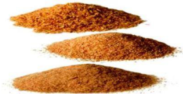
Figure 2.1: Saw Dust

Sawdust is also known as wood dust. It is the by-product of cutting, drilling wood with a saw or any other tool; it is composed of fine particles of wood. Certain animals, birds and insects which live in wood, such as the carpenter ant are also responsible for producing the saw dust. Sawdust's are produced as a small discontinuous chips or small fragments of wood during sawing of logs of timber into different sizes. The chips flow from the cutting edges of the saw blade to the floor during sawing operation.