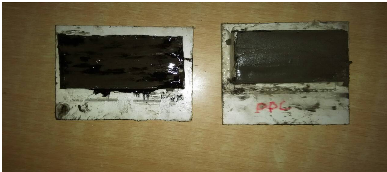
Prism with OPC 53 and PPC with size 6 cm X 1 cm X 1 cm.

Various experiments were carried out to understand compression strength of a cement mortar cube of different size of 7cm X 7cm X 7cm and 4cm X 4cm X 4cm and prism size of 4cm X 4cm X 16cm and 1cm X 1cm X 6cm. The main aim is study on the reactivity of cement and Multi walled carbon nano tubes. To carry out reduced specimen sizes and compare it with standard specimens. To carry out Raman study on cement-MWCNT composites. It improves the property of cement matrix. Further the study also possible upon carry out experiments with different ratio.